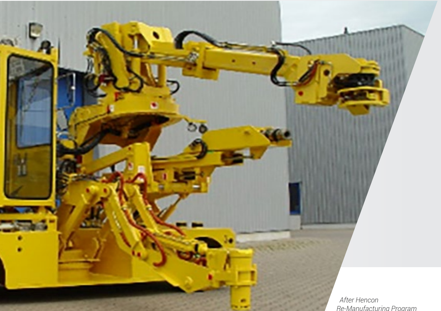
After Hencon Re-Manufacturing Program